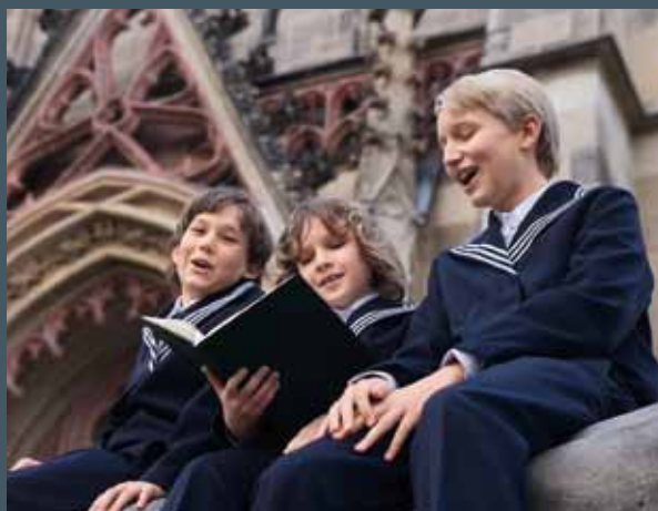
2012 800 th anniversary of the Leipzig St Thomas boys' choir