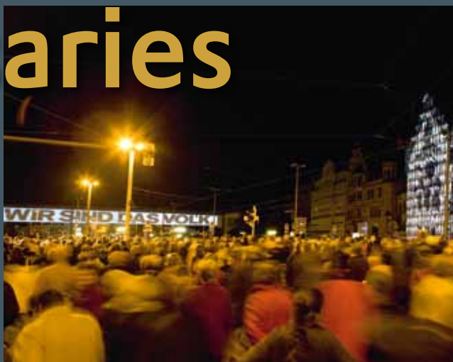
2014 25 th anniversary of the "Peaceful Revolution", which led to German reunification