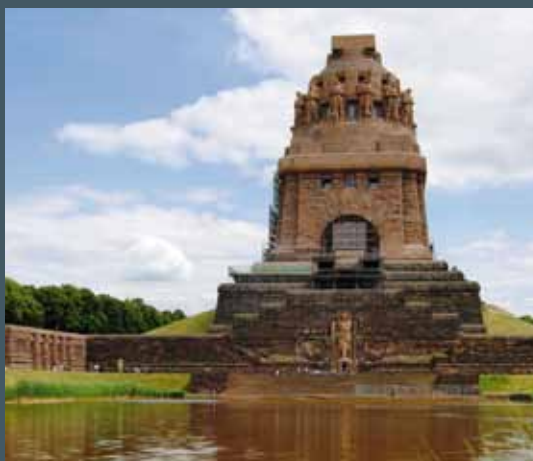
2013 200 th anniversary of the Battle of the Nations 100 th anniversary of the Monument to the Battle of the Nations