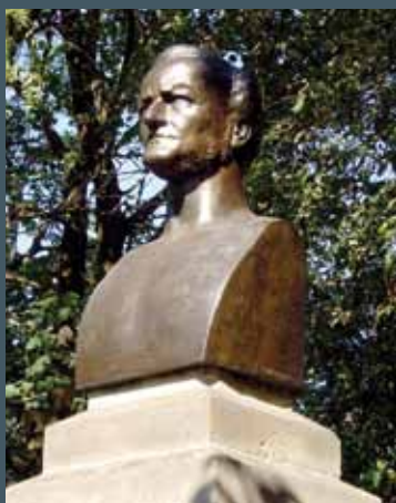
2013 200 th anniversary of the birth of Richard Wagner