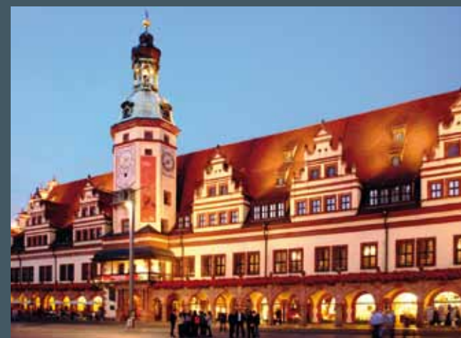
2015 1,000 th anniversary of the first recorded mention of Leipzig